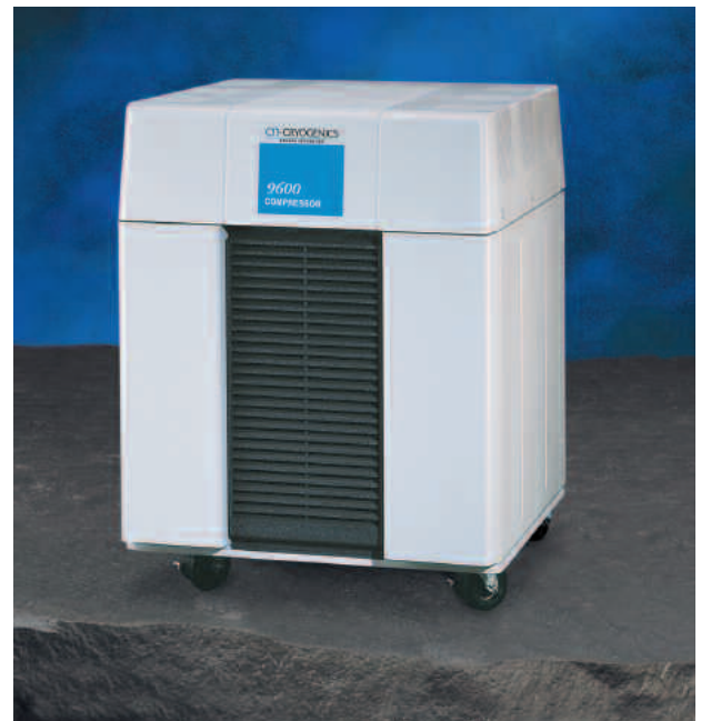
CTI-Cryogenics® 9600 Compressor

The 9600 has been designed for fast unpacking, fast setup, and ease of use. It is a lightweight design, with large casters for easy handling, and its power, helium, and water hookups are all easily accessible for fast installation. The 9600 requires no maintenance beyond a recommended adsorber change once every three years. Circuit protection is provided by a single row of breakers which are easily accessible at the rear panel. The adsorber is easy to reach with the simple removal of a single side panel, and is designed for instant removal and replacement. Remote controls are supported, giving you the flexibility of remote compressor location.